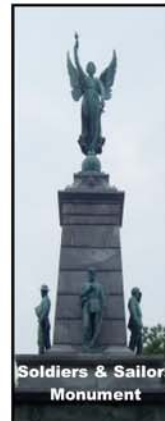
Soldiers & Sailors Monument