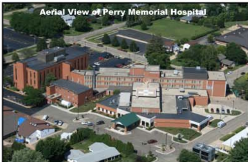
Aerial View of Perry Memorial Hospital

Small town charm and good schools. Fresh air and safe neighborhoods. Historical events, museums, county festivals, fishing, hiking, biking, horseback riding and snowmobiling all at your door step. Your family will have easy access and a short drive to great shopping, sporting events and dining.